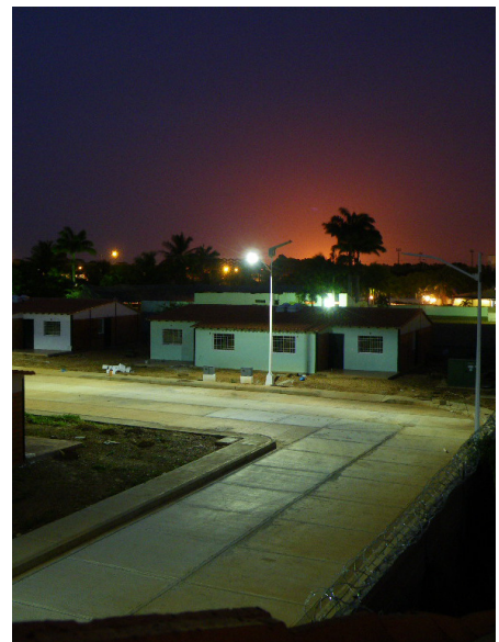
Carmanah EverGEN 1710 solar LED lighting illuminating the roadway at the PDVSA housing complex in Punta de Mata, Estado Monagas, Venezuela.