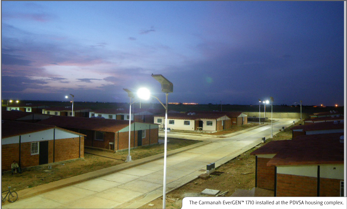
The Carmanah EverGEN™ 1710 installed at the PDVSA housing complex.